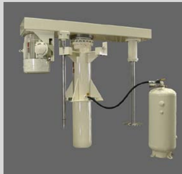
Mezzanine-mounted high speed disperser with air/oil hydraulic lift.

In cases where a multi-agitator set-up is not convenient, one possible solution is to cut down batch size and focus on ways to accelerate mixing and changeover to achieve the target production rate. For instance, a high speed disperser equipped with a swivel system can significantly reduce changeover time. Typical tank-mounted dispersers cannot start the next batch until all contents of the previous run are emptied and fresh raw materials are charged to the same vessel. In comparison, a mixer that can be raised hydraulically out of one vessel, rotated and lowered into another vessel allows for a more nimble and cost-efficient method of production.