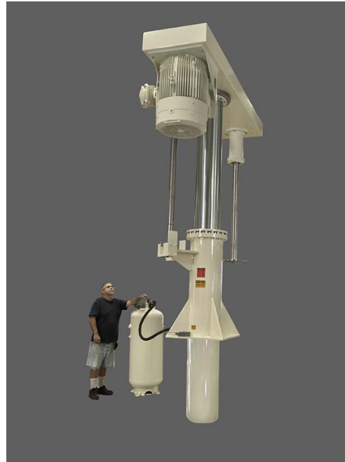
100HP disperser with two-position swivel system, designed for 1,000-gal mix vessels. After finishing a batch, the disperser assembly is rotated 90 degrees to service another vessel.